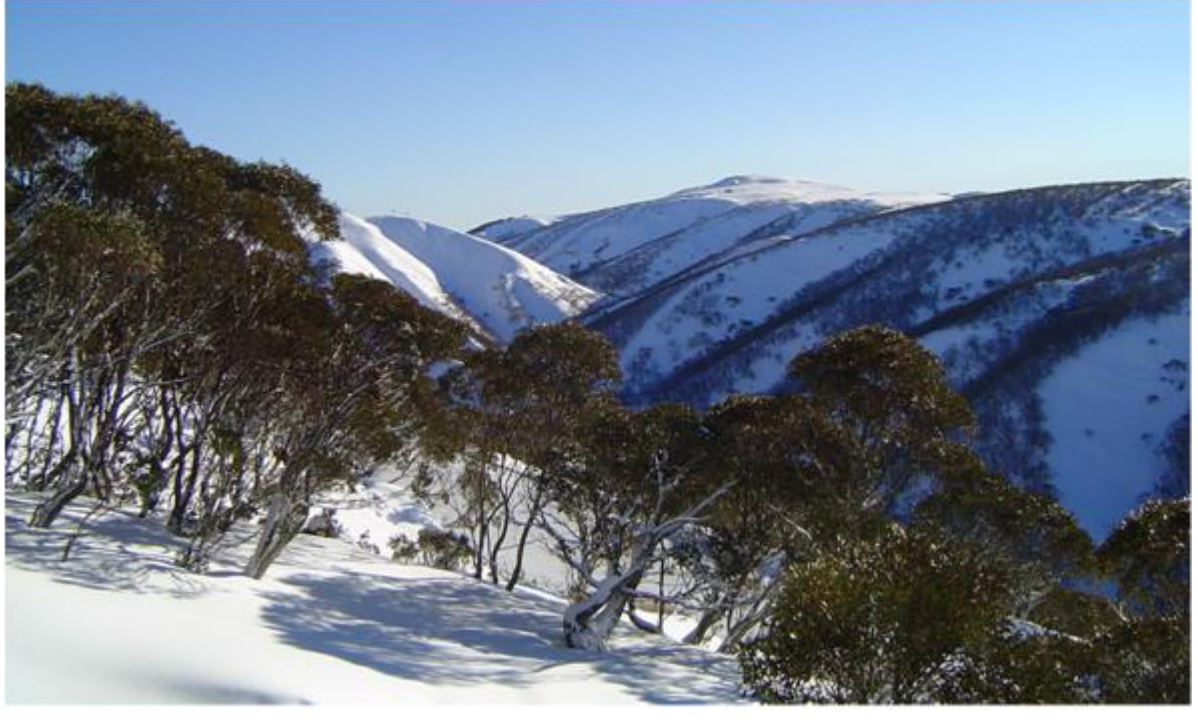
Check out the view from Anton's balcony.

Anton gives you affordable, on-mountain access to Mt Hotham.