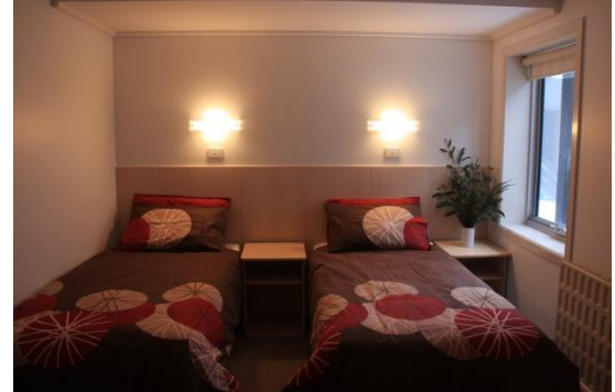
Twin King Singles