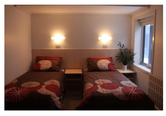
Twin King Singles