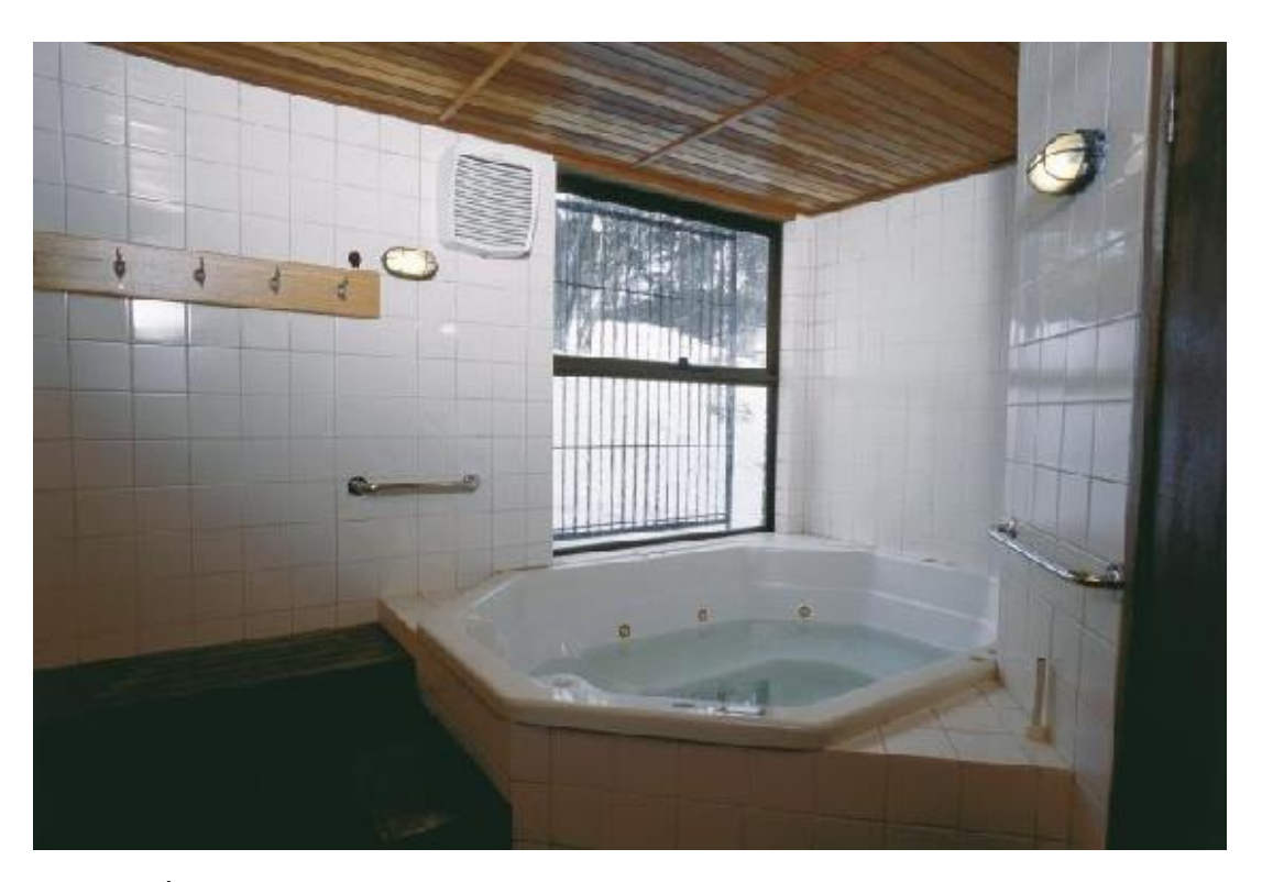
Anton's Spa room.

Sit back and relax after a hard day on the slopes in the Spa & Sauna