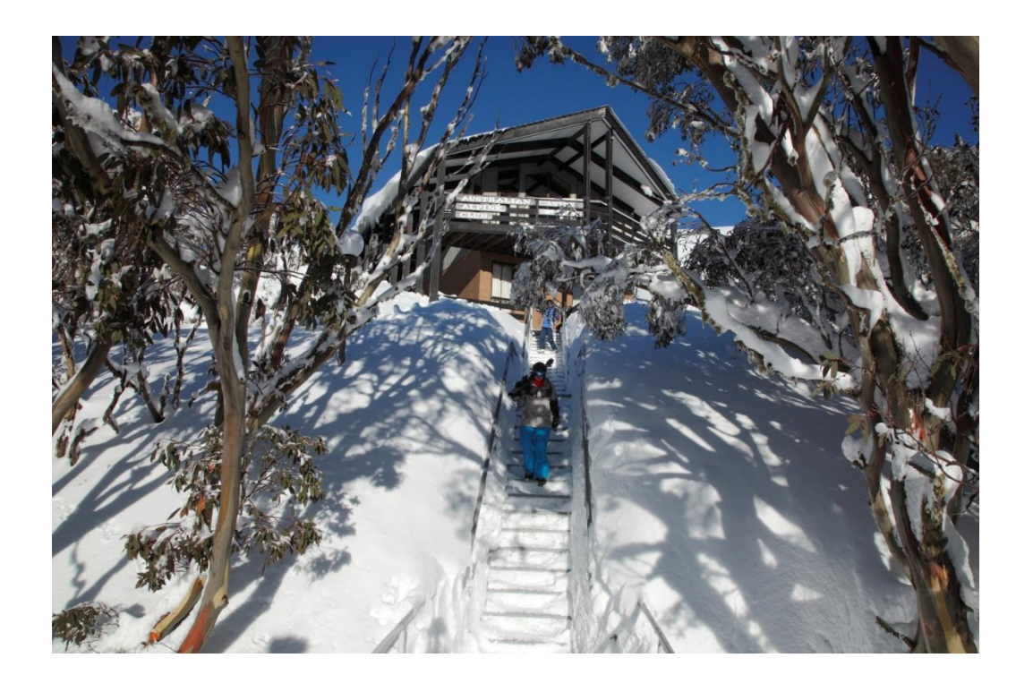
Anton sits high above the Great Alpine Road

Anton is nestled in an unrivalled location at Mt Hotham, in the Victorian Alpine region.