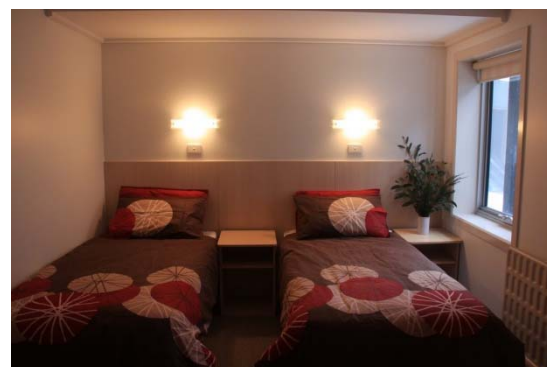
Twin King Singles