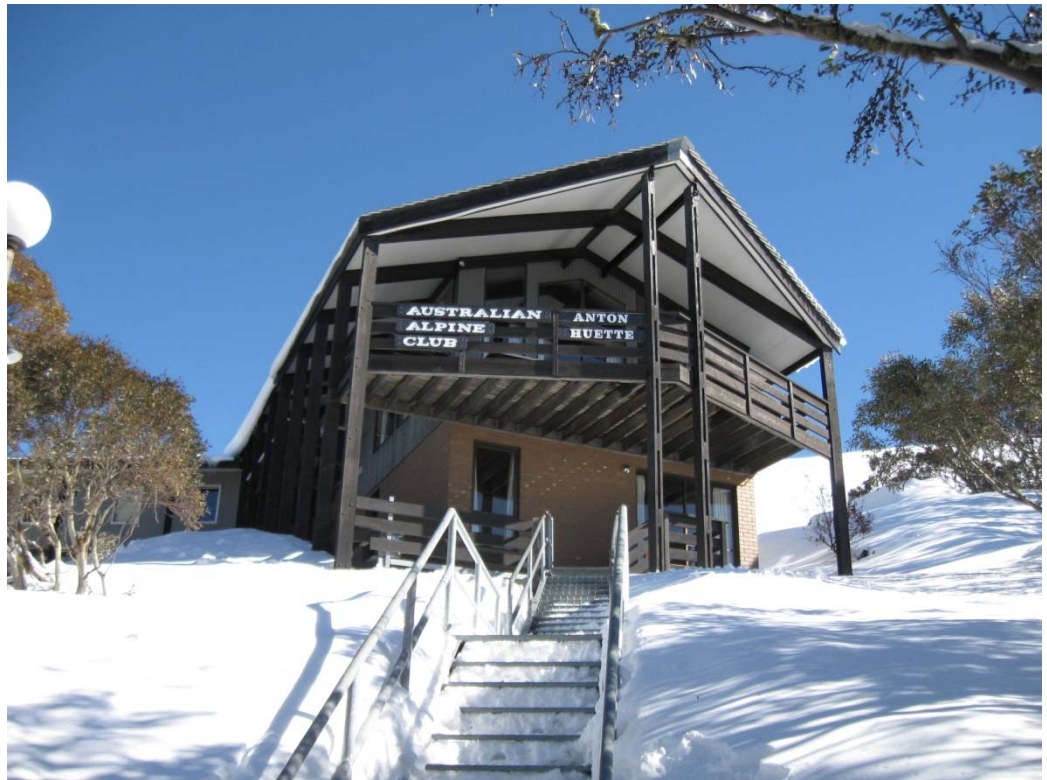
Lodge view – looking south at the communal wing

Anton is nestled in an established part of Mt Hotham, in the Victorian Alpine region.