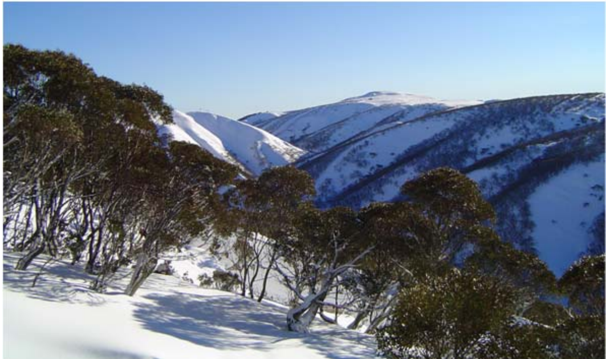
Check out the view from Anton's balcony.

Anton gives you affordable on-mountain access to Mt Hotham.