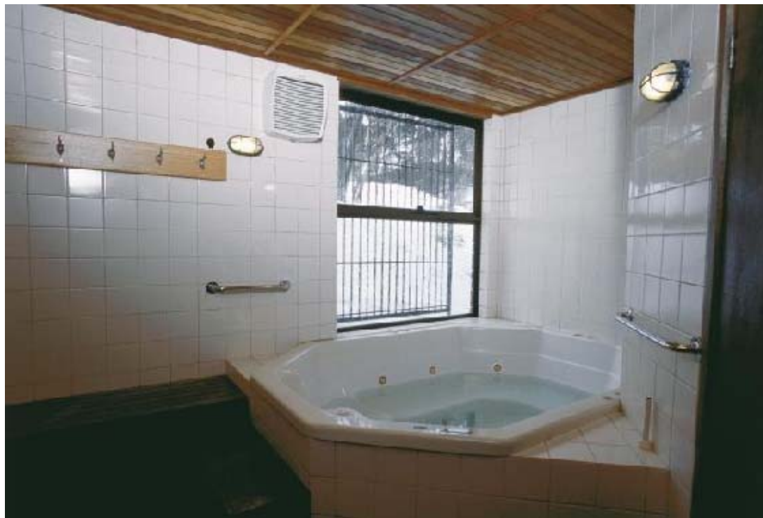
Anton's Spa room.

Sit back and relax after a hard day on the slopes in the lodge's Spa & Sauna