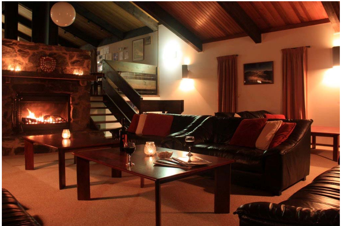
Anton’s living area with open fire place

Anton’s members enjoy relaxing, socialising & have a passion for mountain sport.