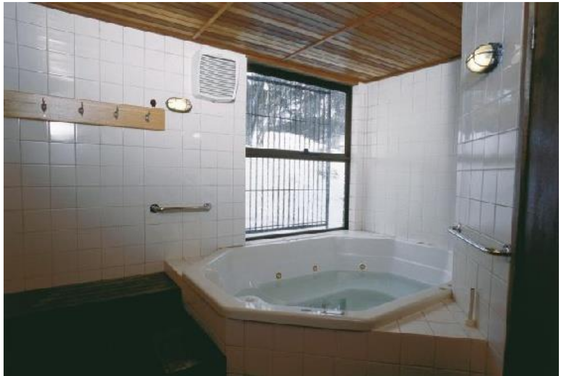
Anton's Spa room.

Sit back and relax after a hard day on the slopes in the Spa & Sauna