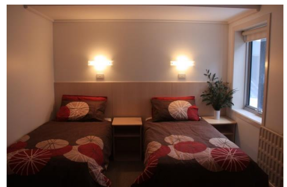
Twin King Singles