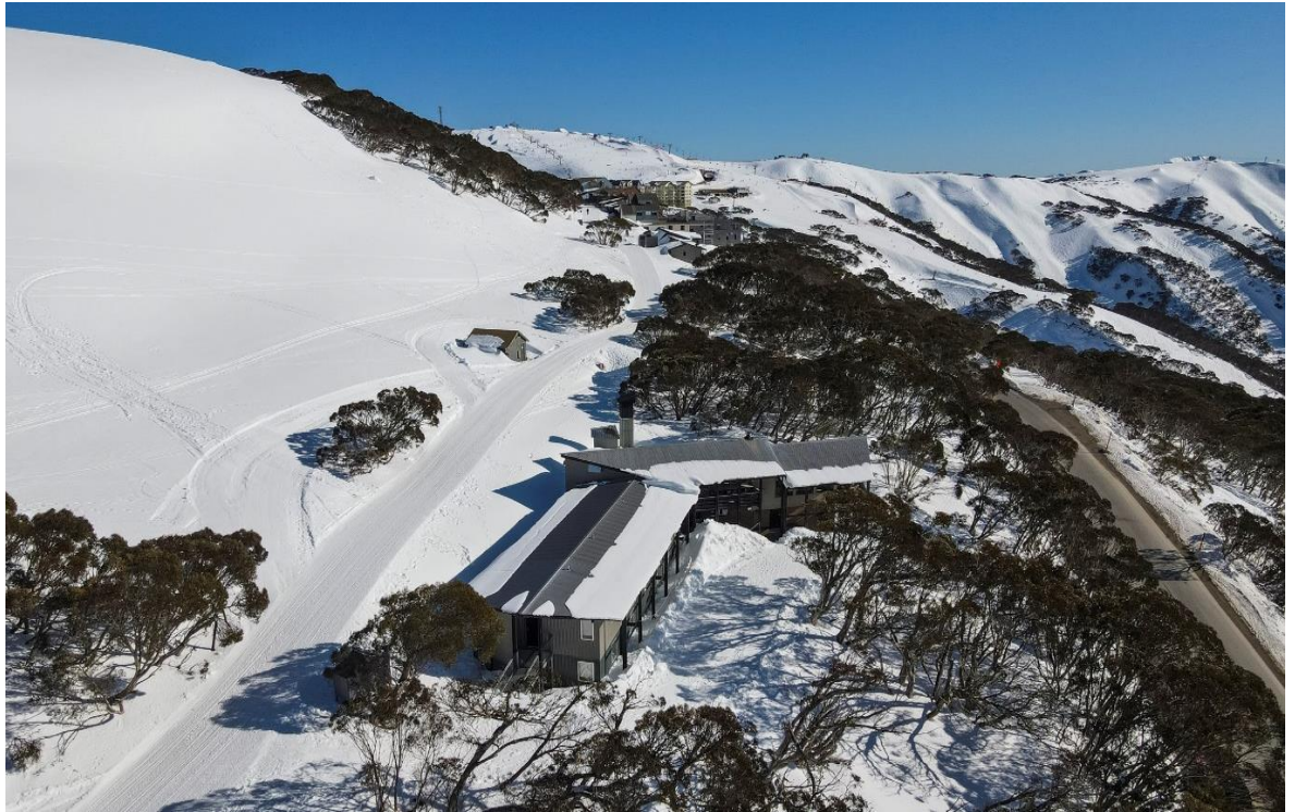
Check out the prime position at Anton Huetten Lodge.

Anton gives you a 4-Star lodge and position at Mt Hotham.