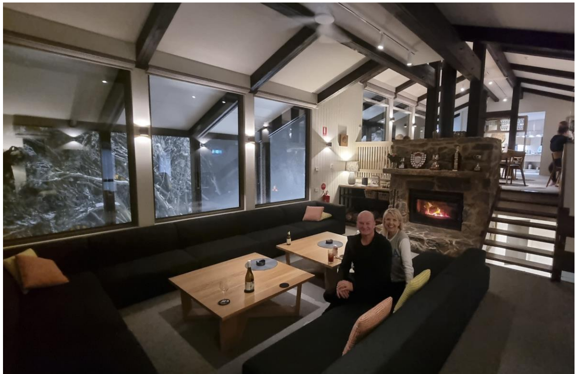
Anton’s living area with wood fire place

Anton’s members enjoy relaxing, socialising & have a passion for mountain sport.